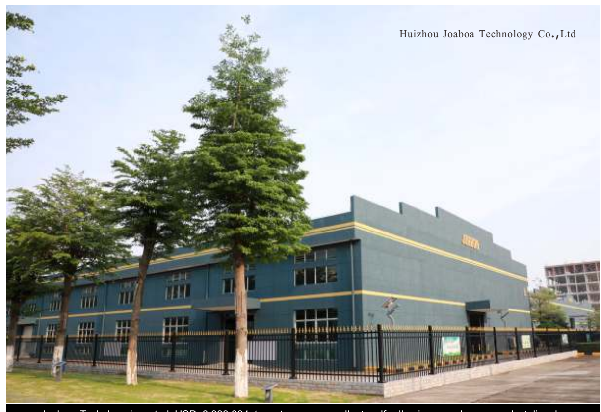
Joaboa Tech has invested USD 8,333,334 to set up an excellent self-adhesive membrane product line by introducing advanced facilities from American A&D company.

Joaboa Tech has formed industrial layout network the whole China first. With advanced facilities, strict QMS and excellent environmental facilities, Joaboa make sure good quality for it's products.