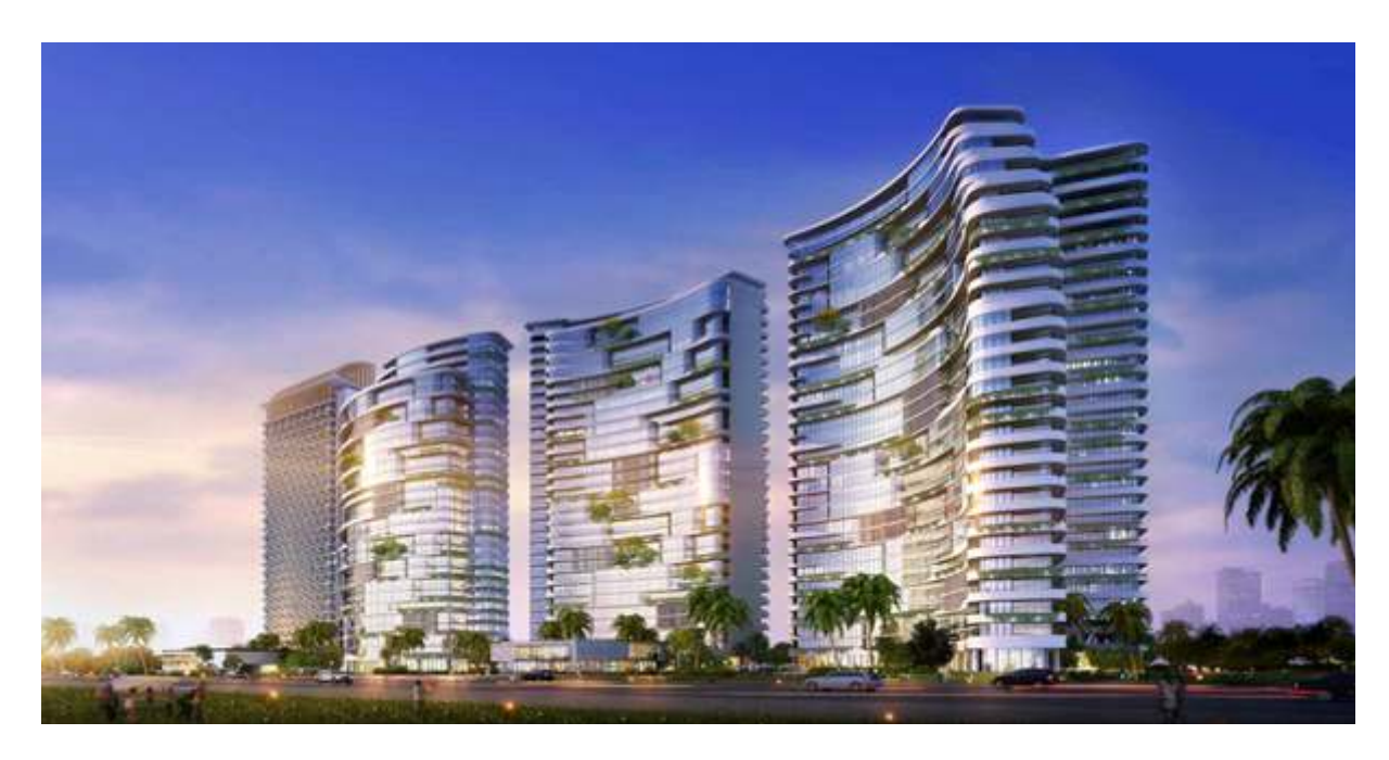
The Number One Condominium Jomtien Pattaya Phase 1