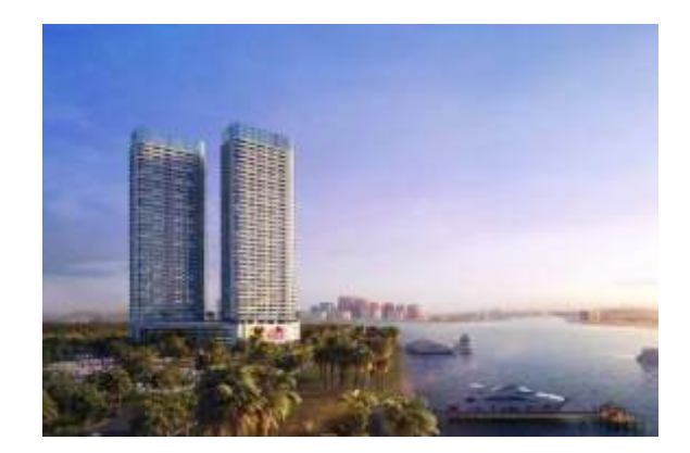
La Vista One