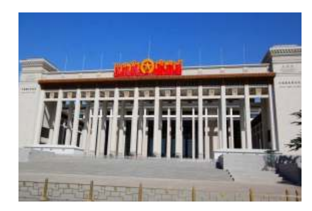
National Museum of China