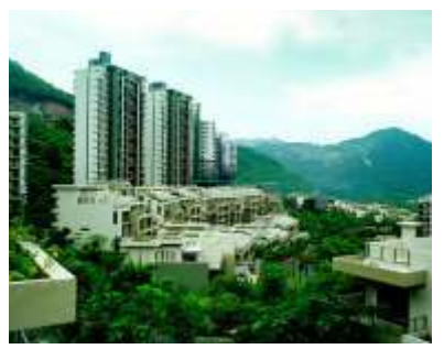
Basement, roof and other place of industrial and civil construction.