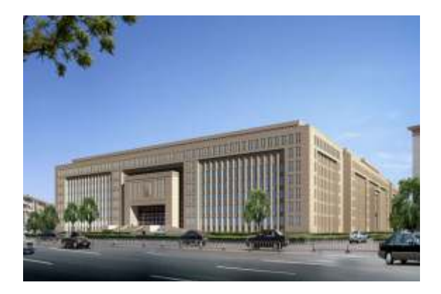
Ministry of Public Security Office Building — Another Landmark in Tian'anmen Area