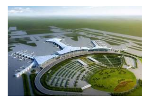
Tianjin Binhai International Airport