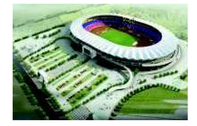
Tanzania National Stadium — China's Key Foreign Aid Project