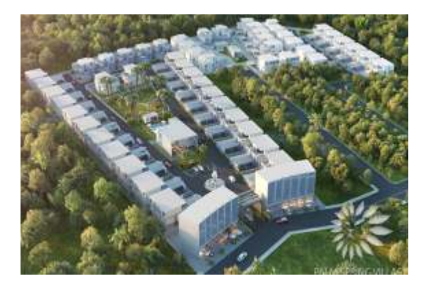
Pattaya Palm Spring Villas Phase 1