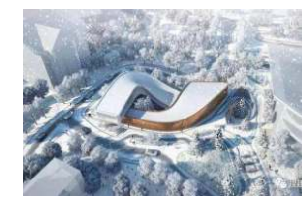
The Winter Olympics in Beijing Zhangjiakou —The First Winter Olympics in China